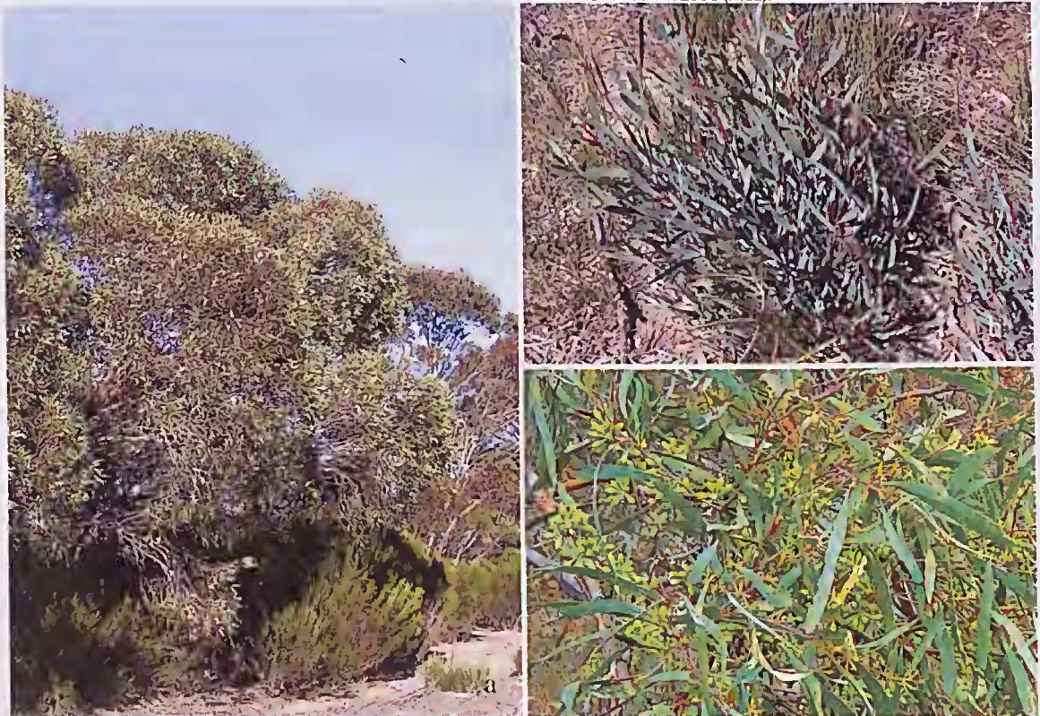
Figure 8: Eucalyptus polybractea subsp. subcerea . a. mallee, Nurcoung F.R.; b. coppice leaves, Nurcoung F.R.; c. buds, Lower Norton.

Additional specimens examined: VICTORIA. Smith Reserve, SW of Horsham, 36° 50' 13" S., 142° 05' 30" E., K.Rule 0234, 5 iv 2002 (MEL); Lower Norton-Nurrabiel Road, 6.8 km S of Lower Norton, 36° 50' 41" S., 142° 03' 47" E., K.Rule 0230, 5 iv 2002 (MEL); Tooan Scrub, 36° 47' 05" S. 141° 43' 15" E. K.Rule 9445, 8 iv 1994 (MEL) west base of Mt Arapiles, 36° 42' 00" S., 141° 53' 00" E. K. Rule 0221 and V. Stajsic (MEL); Mitre-Nurcoung Road 36° 41' 14" S. 141° 44' 32" E. K.Rule 2412 24 iii 2012 (MEL); Blake's Road, 5W of Tooan, 4.2 km E of Womimera Hwy, 36° 50' 55" S., 141° 46' 05" E. K.Rule 13706 3 x 2006 (MEL).